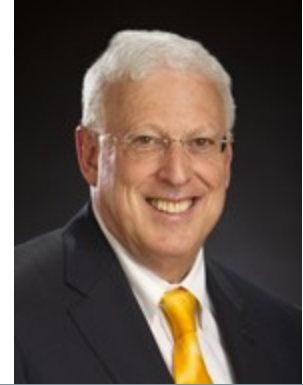
Dr. Robert Sternberg, 2011 Create.OK.Lead Keynote Speaker

Robert J. Sternberg is Provost and Senior Vice President and Professor of Psychology at Oklahoma State University. He is also Honorary Professor at the University of Heidelberg, Germany. Prior to arriving at Oklahoma State, he was Dean of the School of Arts and Sciences and Professor of Psychology and Education at Tufts University. Before going to Tufts, he was IBM Professor of Psychology and Education and Professor of Management at Yale University. Sternberg's PhD in psychology is from Stanford and he has 11 honorary doctorates. His BA in psychology is from Yale.