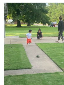
From left to right: Sober living in Enid. Sober living in Stillwater. A mom and her two children enjoying playing in the front yard after moving in to recovery housing.