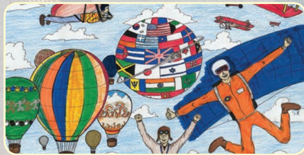
Sai Mandalapu, NJ - United States 1st Place, Intermediate

Airplanes and gliders amaze the crowd with spins, loops, and dives. Powered planes show their skills in an air navigation race. People look up to see colorful hot air balloons and airships dotting the sky. Hang gliders compete for aerobatic ability, while paragliders show off their aerobatic and landing accuracy abilities. Parachutists work together in incredible formations and last, but not least, microlights and paramotors compete in slalom races as helicopter pilots show off their craft in slalom and accuracy competitions. All of this and much, much more. Good luck!