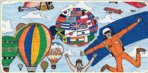
Sai Mandalapu, NJ - United States 1st Place, Intermediate

Airplanes and gliders amaze the crowd with spins, loops, and dives. Powered planes show their skills in an air navigation race. People look up to see colorful hot air balloons and airships dotting the sky. Hang gliders compete for aerobatic ability, while paragliders show off their aerobatic and landing accuracy abilities. Parachutists work together in incredible formations and last, but not least, microlights and paramotors compete in slalom races as helicopter pilots show off their craft in slalom and accuracy competitions. All of this and much, much more. Good luck!